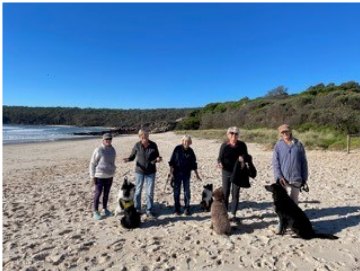
A walk at Lions' Park, Pambula.